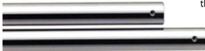
Twin stainless nozzles for assured thoroughness